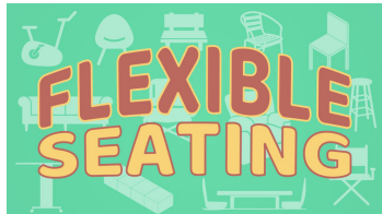
Some examples of flexible seating from around the district